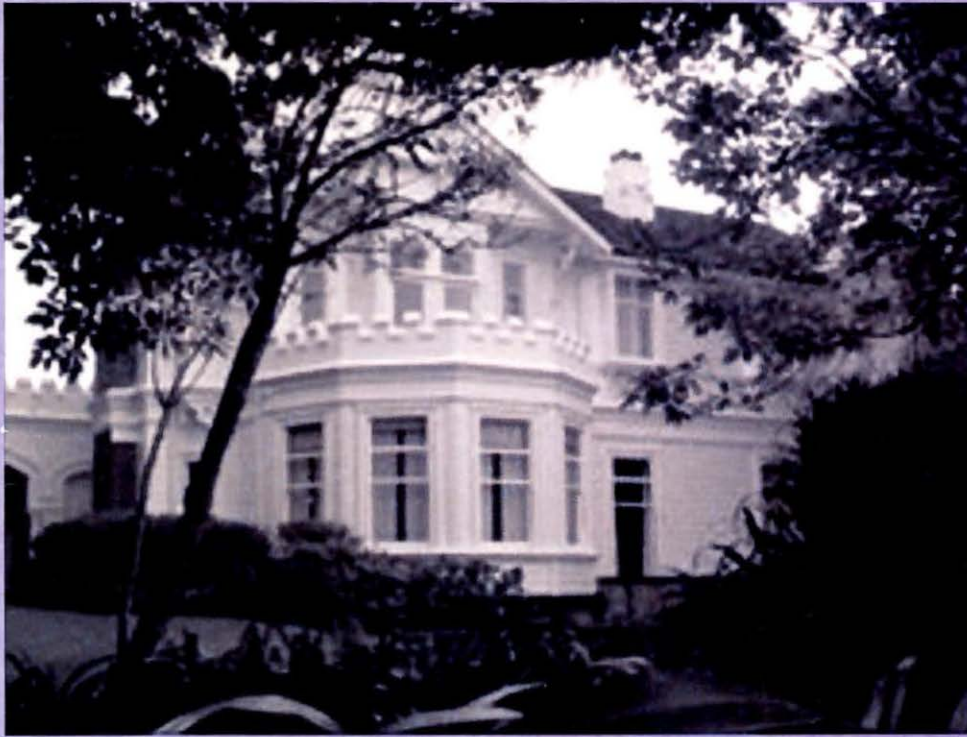
Homewood - Wellington